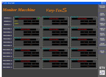
Our Very-TexS server can monitor fabric inspection machines and connect with management software applications