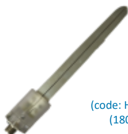
(code: HF7) Dagger probe (180mm) for folds