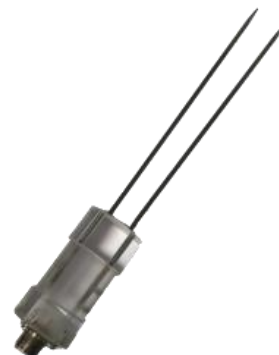
(code: HF3) 20 mm needle probe for bales