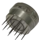
(code: HF4) Needle pad probe for beams