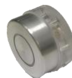
(code: HF6) Pad probe for non-moving fabrics