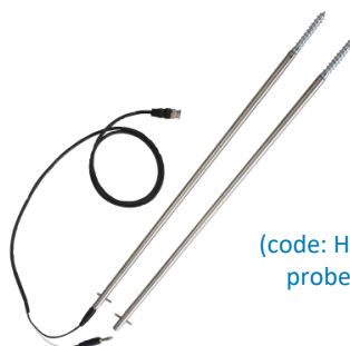
(code: HF9) 500 mm Needle probe for packed bales

“ Other kinds of probe available on demand “