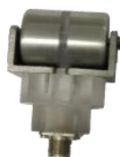
(code: HF5) Roller probe for moving fabrics